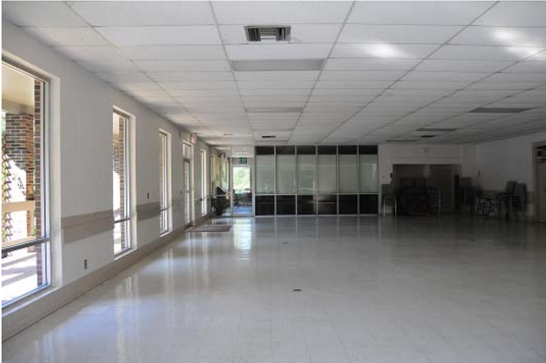
Figure 4. Indoor Space for Headquarters or Use in Inclement Weather