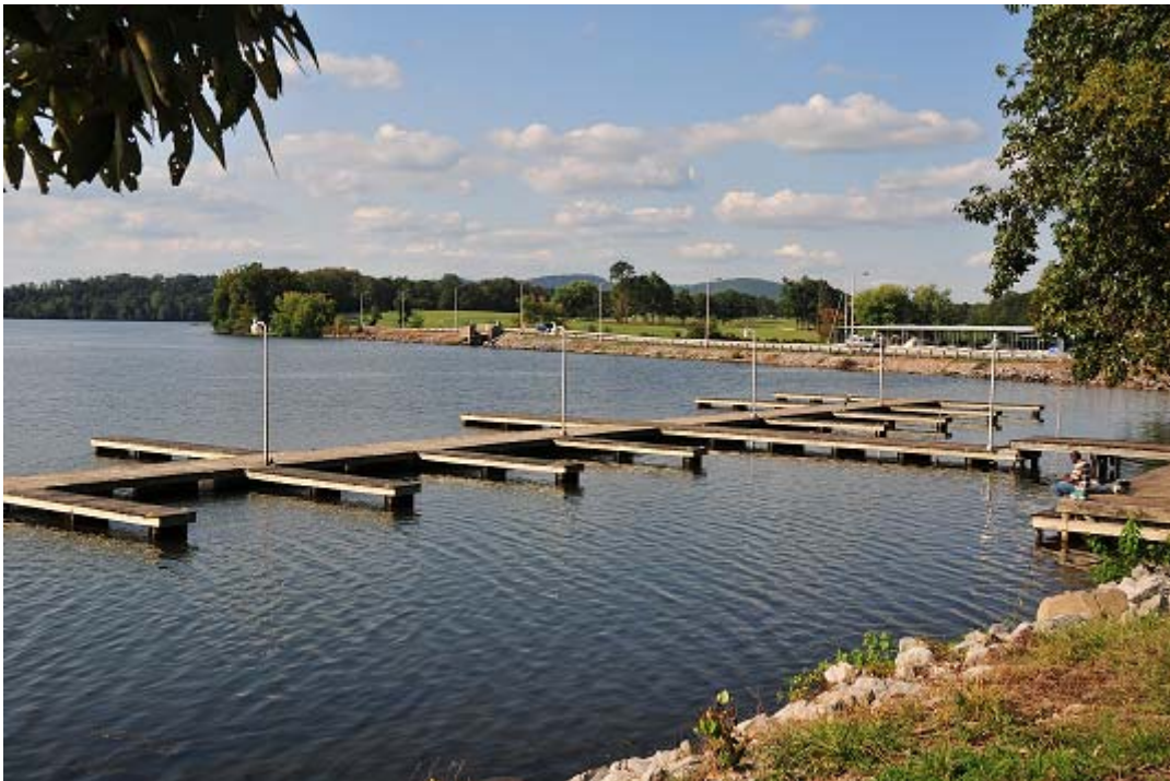
Figure 5. Lighted Piers Adjacent to Ops Area and Shore Facilities