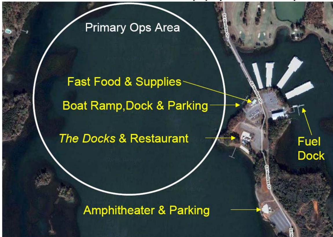
Figure 3. Overview of Primary Operations Area and Adjacent Shore Facilities as shown

An overview of the GPC facilities is shown in Figure 3. An indoor space with tables and chairs for inclement weather is located on the GPC property one-half mile away and is