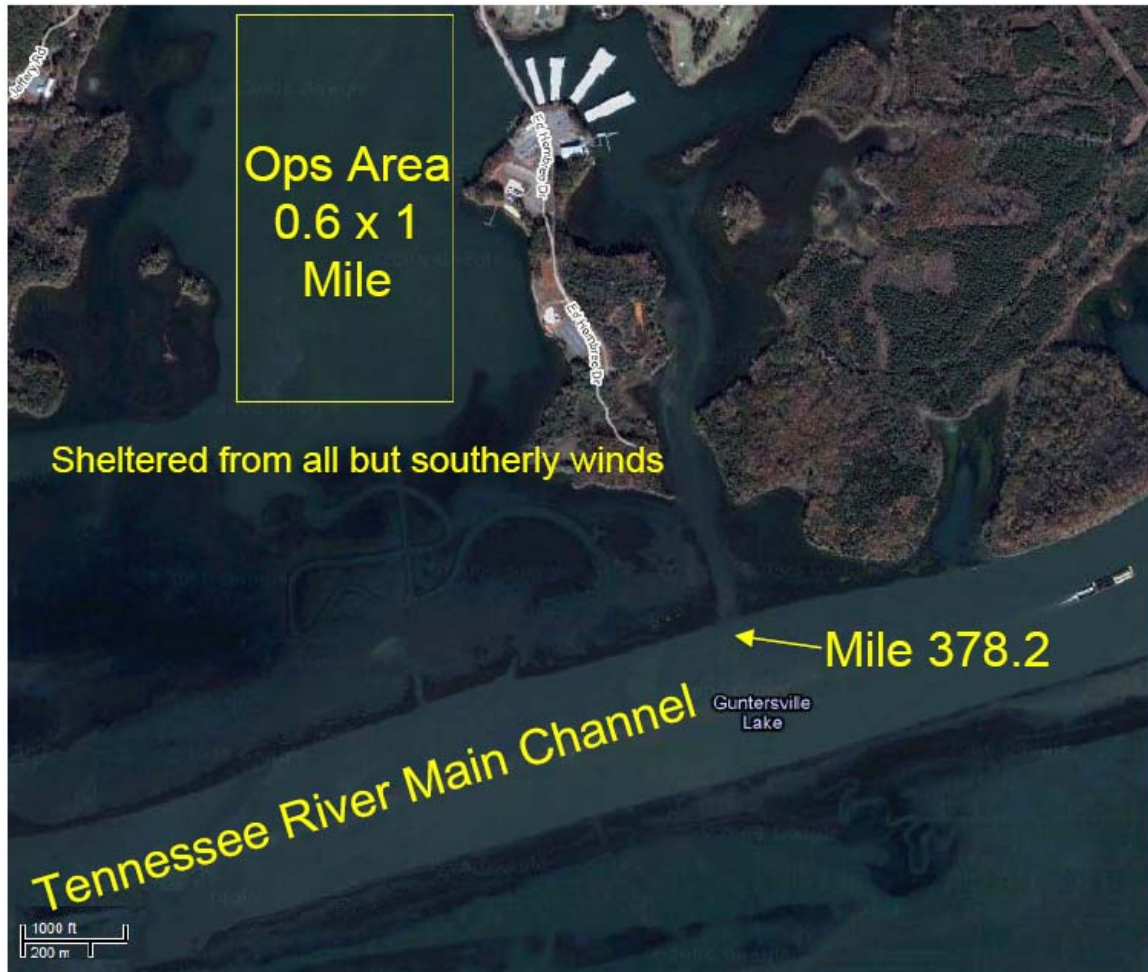
Figure 2. Satellite View of Primary Operations Area and Adjacent Shore Facilities

The specific water location is on Gunterville Lake at Tennessee River Mile 378.2, North Sauty Creek embayment only a few miles from the southern-most point on the Tennessee River. The water there is warm, sheltered (low current and waves), with large areas for surface operations. Gunterville Lake is the second largest of the TVA lakes with over 900 miles of shoreline. Figure 2 shows a satellite view of the primary proposed operations area that is adjacent to the shore facilities. A larger secondary operations area less than a mile away is available to support concurrent additional DSAR Team operations or in case of high winds from the south.